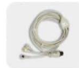
3-lead ECG cable