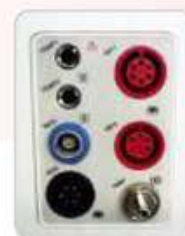
Double channel IBP Achieving real-time blood pressure monitoring of patient