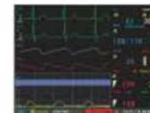
Standard Interface for nine parameters: FHR, TOCO, FM, PR, SPO2, NIBP, ECG, RESP, TEMP