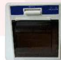
Built-in double channel thermal printer