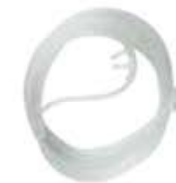
Nasal Sample Line