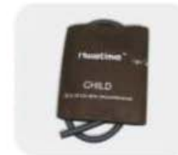
Pediatric blood pressure cuff