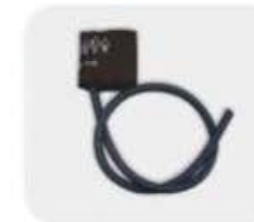
Neonate blood pressure cuff