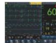
ECG standard interface