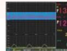
Standard Interface for three parameters: FHR, TOCO, FM