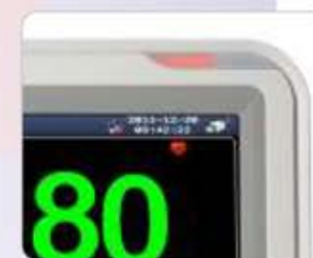
3 levels of audible, visual and audio alarm