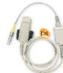
SpO 2 Probe