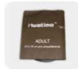
Adult blood pressure cuff