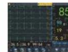
Full 7 lead ECG waveform interface (Optional)