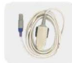
Adult SpO2 probe