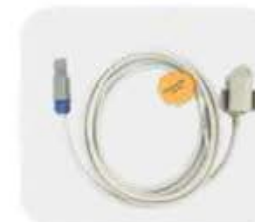
Pediatric SpO2 probe