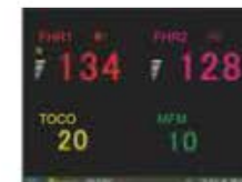
Big Font Interface