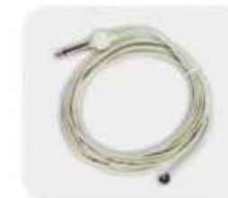
Body surface temperature probe