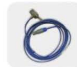
Neonate SpO2 probe