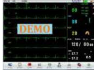
Max 8 waveform display simultaneously max 6 leads ECG waveforms display