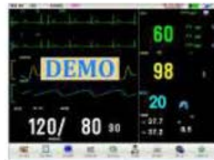
Big font interface