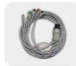
5-lead ECG cable